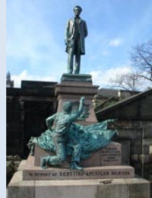
Lincoln statues from left to right: Tijuana, Mexico; London, England; Manchester, England; Edinburgh, Scotland